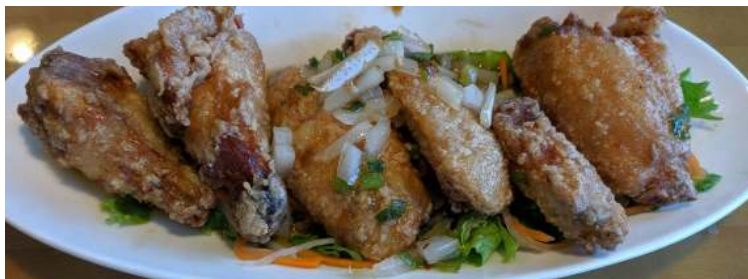
Cánh gà chiên nước mắm 5